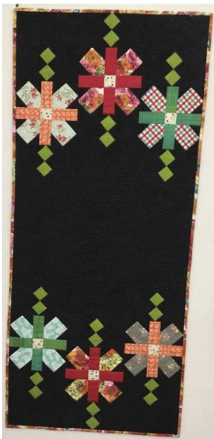
Table Runners from are patterns in the Trendy Table books that I purchased from Calico Mermaid.